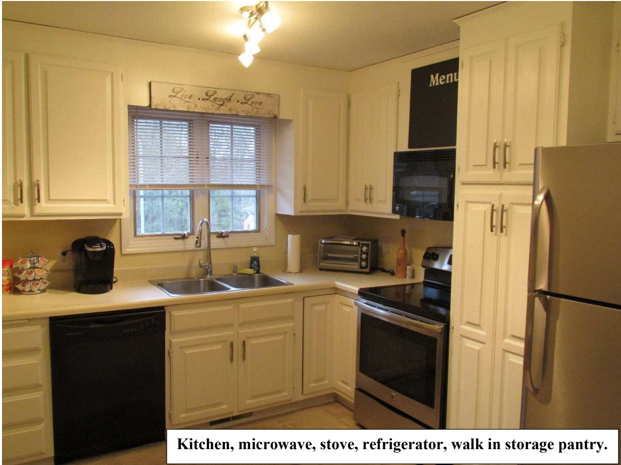
Kitchen, microwave, stove, refrigerator, walk in storage pantry.