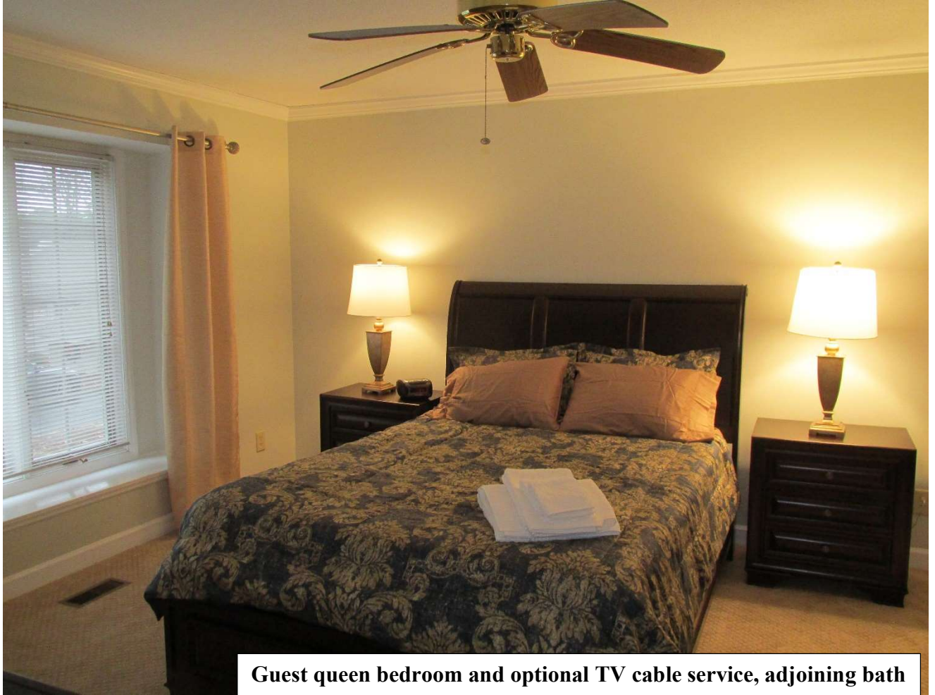
Guest queen bedroom and optional TV cable service, adjoining bath