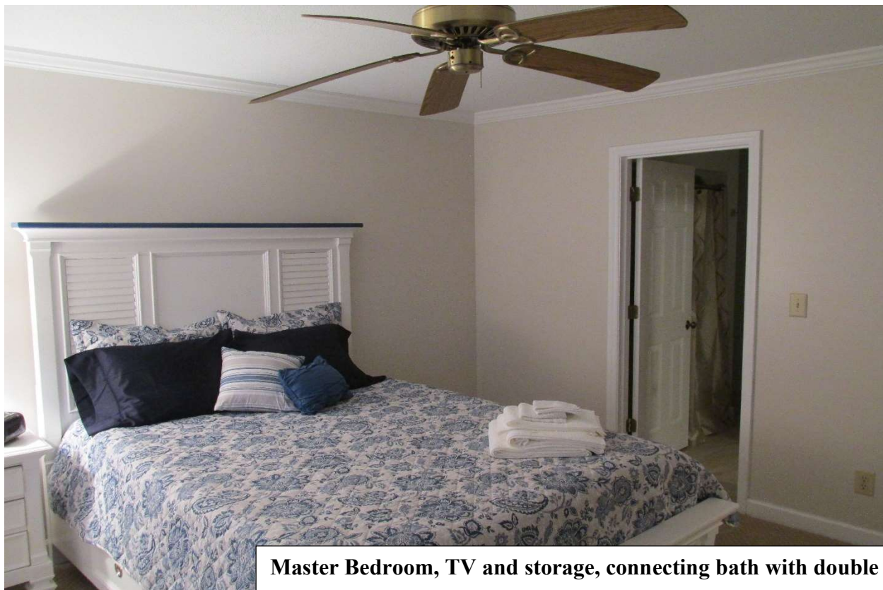
Master Bedroom, TV and storage, connecting bath with double sinks.