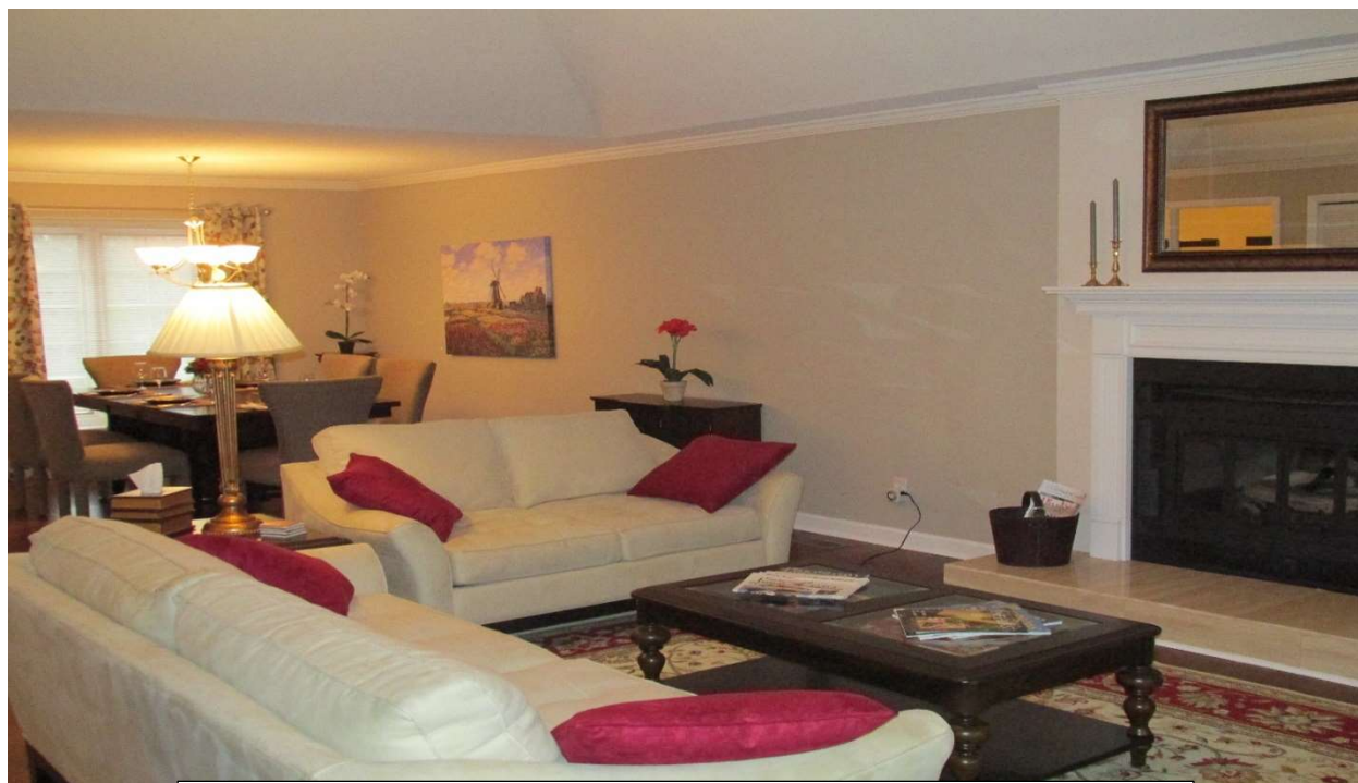
Living room with gas fireplace, TV, bookcase, sliding door to back area

Link to information flyer: http://www.connellandassoc.com/pdf6/212TallTreesDrinformation.pdf