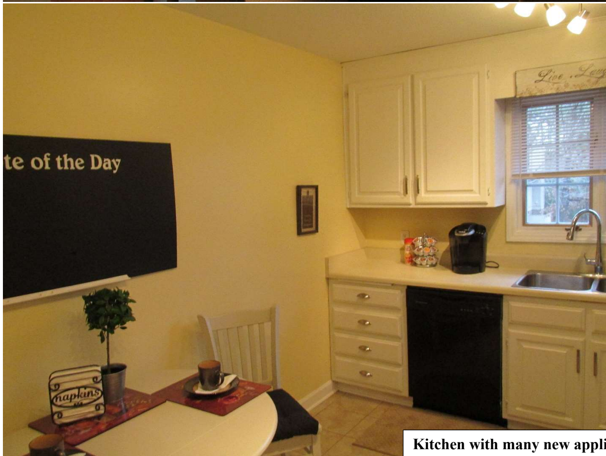
Kitchen with many new appliances